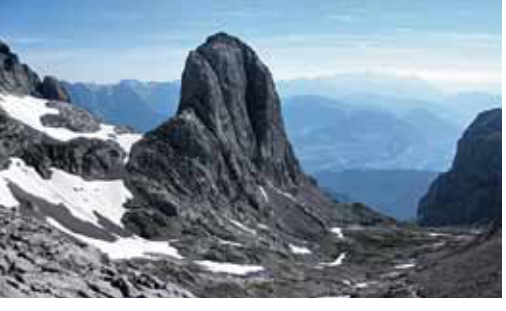
The stone monument "Torsäule" (gate pillar) commemorates the wife of the Pochburger.